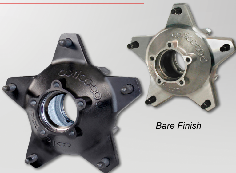
Black E-Coat Finish

Wilwood's racing brake rotors are manufactured from proprietary iron alloys to outperform all others with matched weights, durability, and value. Rotors for wide five hubs are available in